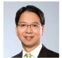
The Hon. Charles MOK, JP Legislative Council Member