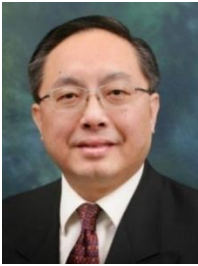
Mr. Nicholas W. YANG, GBS, JP Secretary for ITB